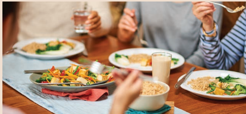
Eat meals with others