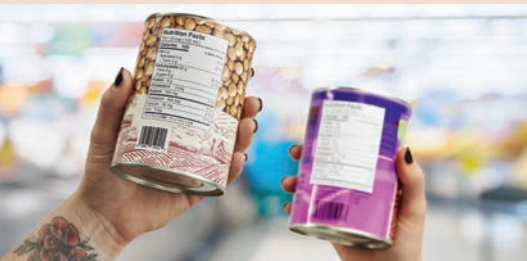
Use food labels