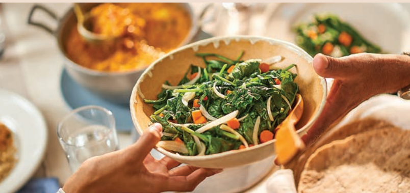
Enjoy your food