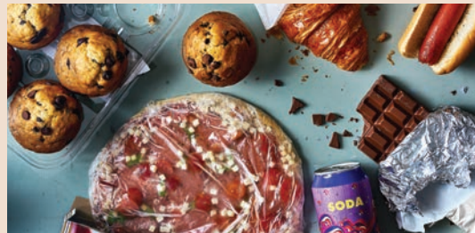
Limit foods high in sodium, sugars or saturated fat