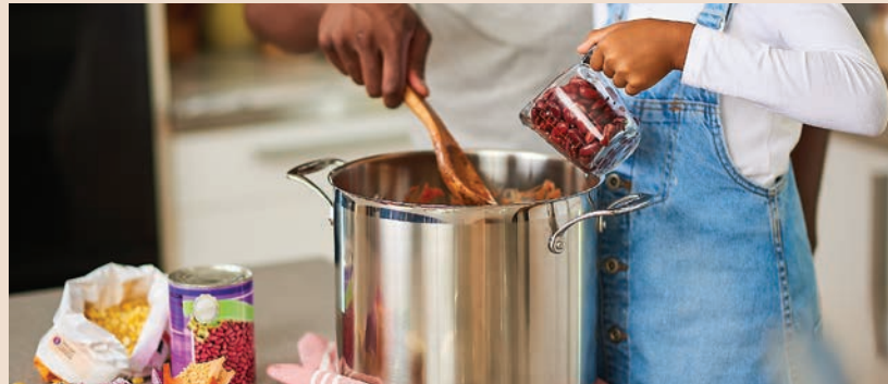
Cook more often