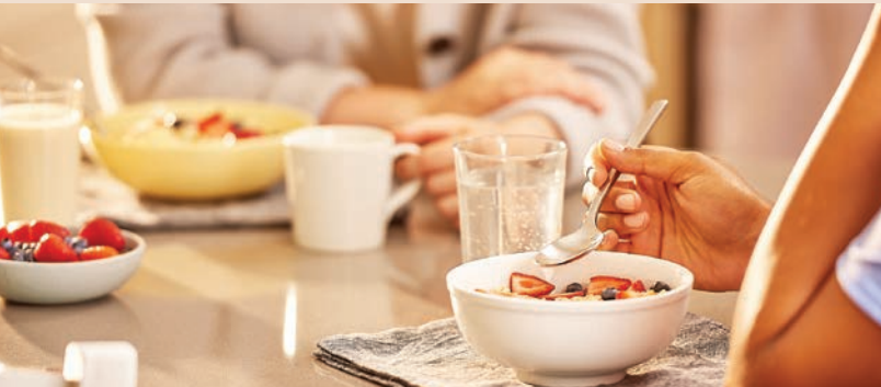
Be mindful of your eating habits

Healthy eating is more than the foods you eat